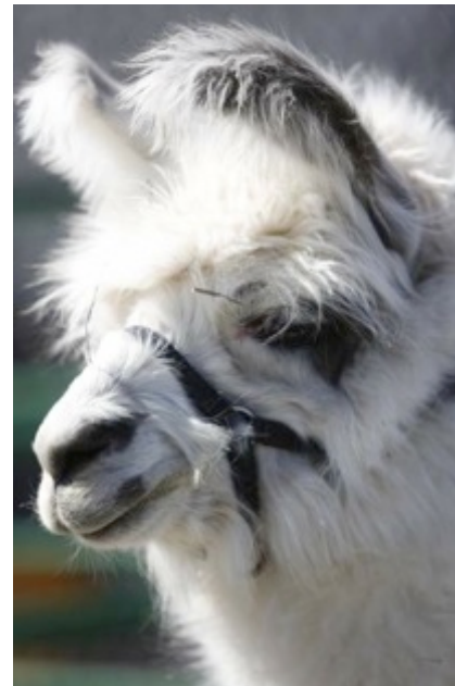
Sweet softness and gentle natured, McKenzie Lakes Ranch, "In Like Flynn", curious about all of these people coming around to pet him..