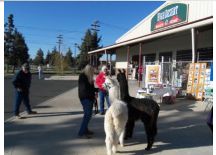
First time out in public, 8 month old "Night Moves" (Suri, right) and In Like Flynn (Mixed Argentine, left) scope out the scene