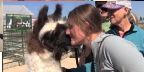
Llama Dreams "Hazel" nuzzles visitors